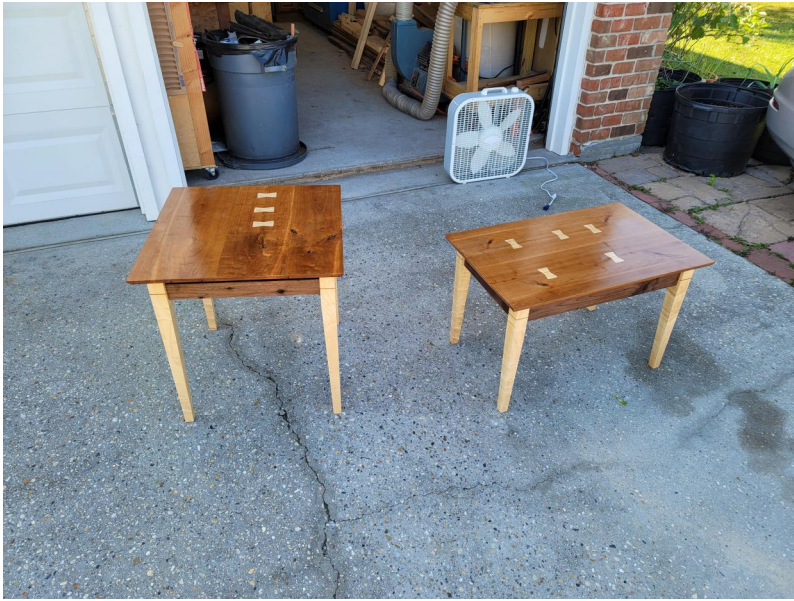
Aaron Mahnke made two new tables for his office: a coffee table and an end table, both with butterflies. The legs are maple with cherry inlay, the stretchers walnut, and the floating top is cherry. The lower photo shows the first table, made last year.