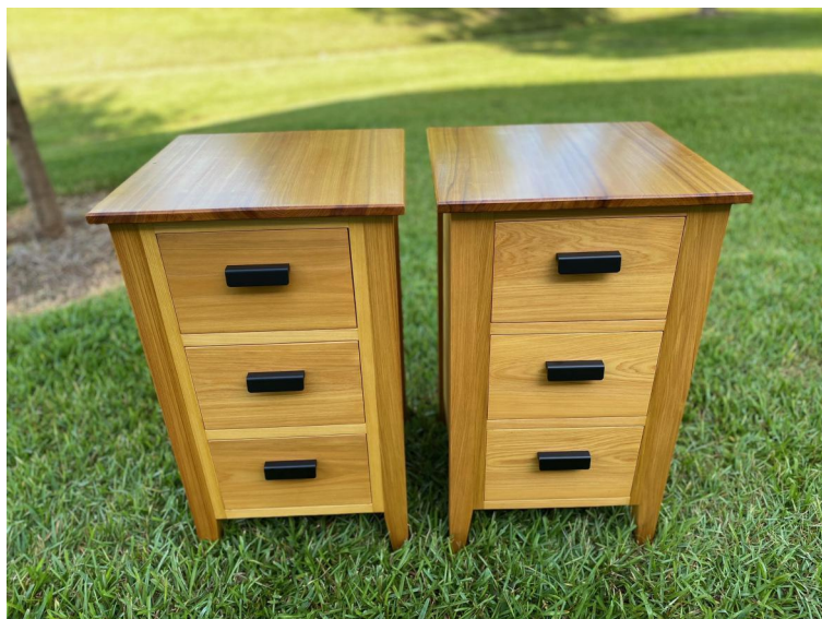
Mike Sibley built a pair of night stands with dovetail joinery and inset drawer fronts.