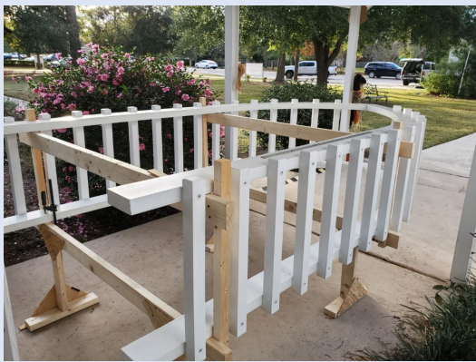
Assembly was done at the church using the custom-built sawhorses.