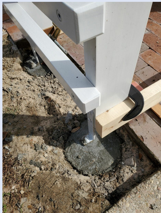
Foundation work was done under the bricks.