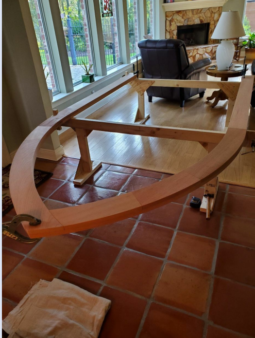
The large arches filled his workshop and then some.