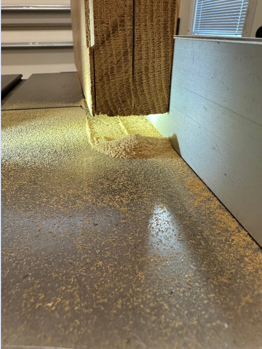
Brian shows extreme dust build-up in the kerf prior to the overhaul.