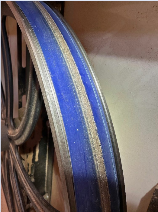
One item on the list is to clean or replace the tires on the wheels.