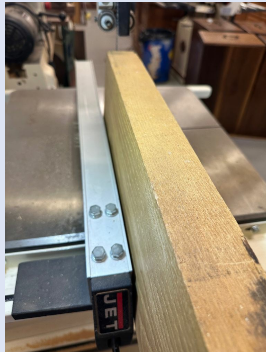
Another task is to square the table to the blade and the fence to the table. Brian sets the bottom of the gullet of the blade in the center of the upper tire by adjusting the tilt of the upper wheel.