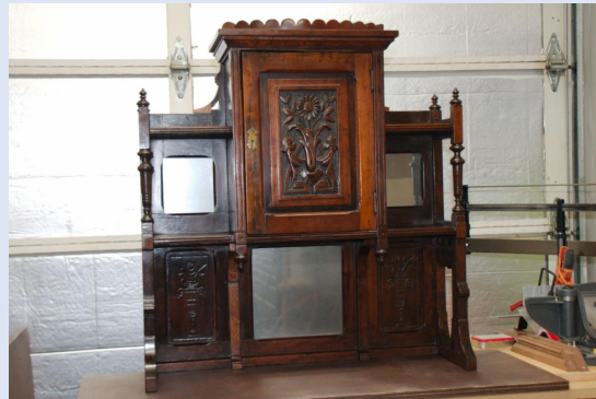
Pat Robbert restored an Eastlake cabinet, cleaning, fabricating missing wood parts, and installing glass with a mirror-like finish.