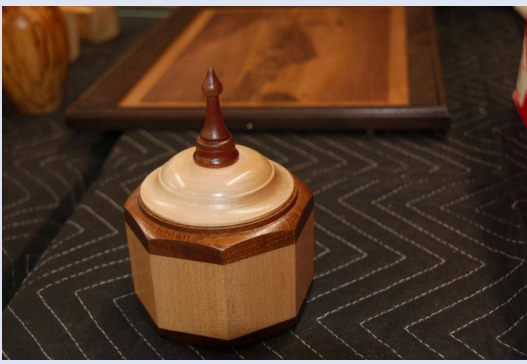
This pot uses miter joints to connect the pieces cut using his polygon cutting jig.