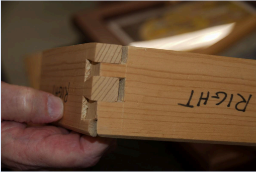
This is a sample dovetail joint with the lower joint mitered.