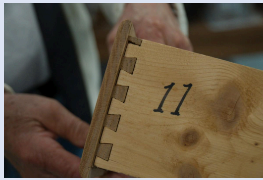
Here we see half-lap dovetails.