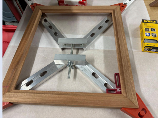
Pat has had success using this jig which secures all four joints at the same time, minimizing any error.