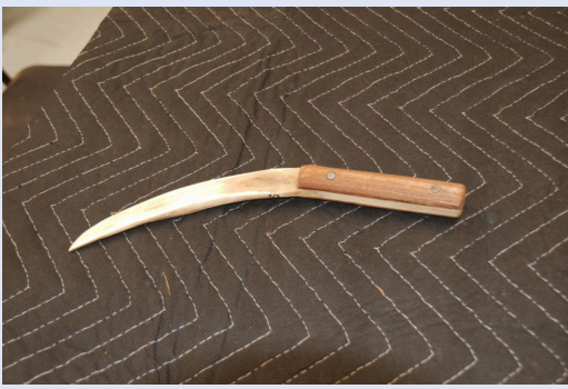
Collin's wooden knife.