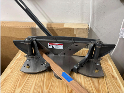
Pat uses the miter trimmer to perfect the angles and the lengths of each piece.