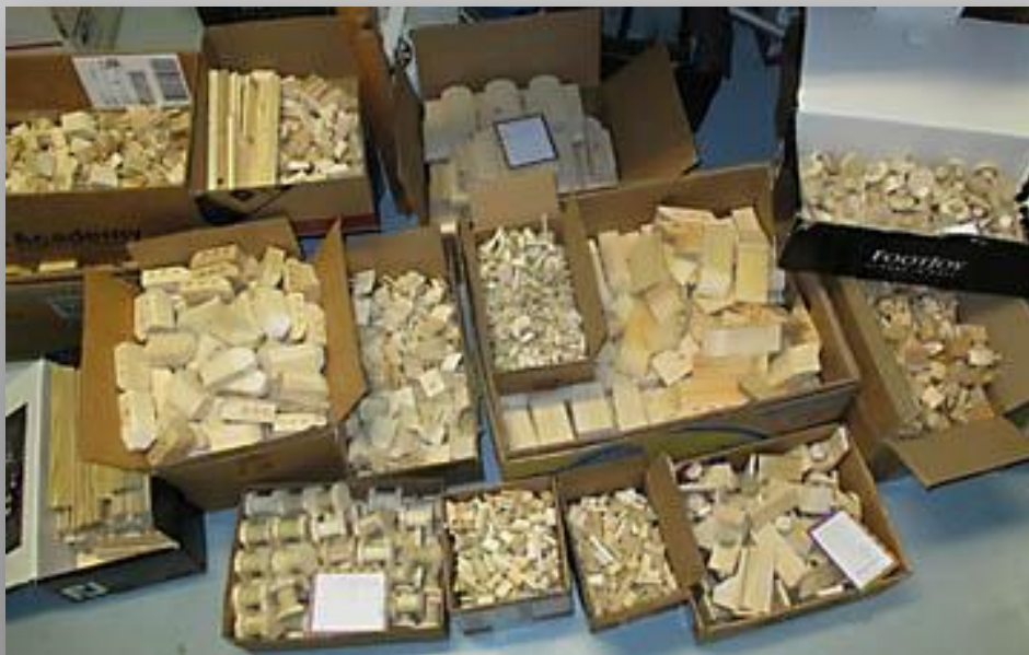
One member's (Bob Busfield) production of parts for the Wooden Boat Festival

Remember, count your fingers before and after you work and make sure that it's the same amount. Always think of a safe way to accomplish what you want.